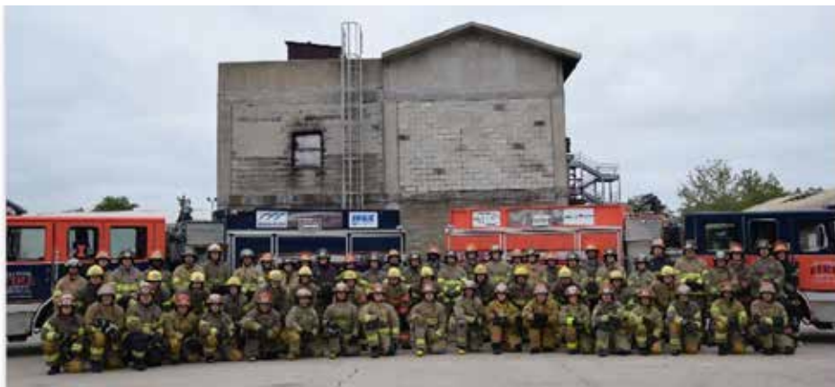
IFSI congratulates the 2024 Fall Academy and BOF graduates and wishes them well as they return to their home departments.