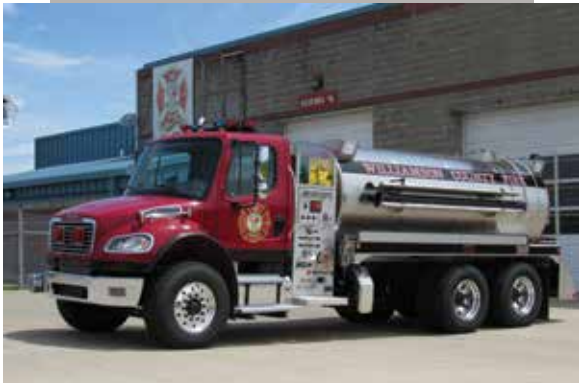
Tender – 2016 Mid-State Tank, Freightliner 3000 gallon/500gpm Darley pump