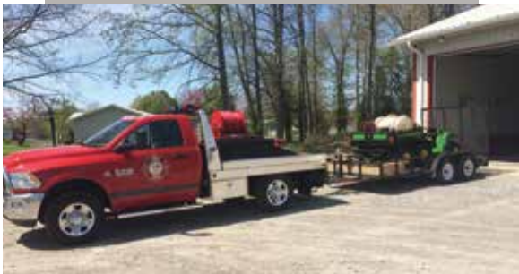
Brush truck - 2016 Dodge 3500, Cummins diesel, 300 gal. CET skid, PowerArc Emergency Lighting