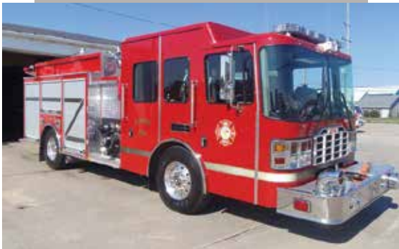
Engine – 2014 Ferrara Ember 1750gpm/1000 gallon