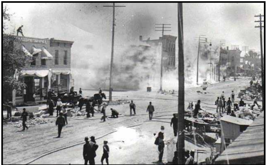
Downtown Fire of 1895

With the continued support of the community, the Board of Trustees of the Lockport Township Fire Protection District strives to provide the highest level of service to the communities that we serve. ■