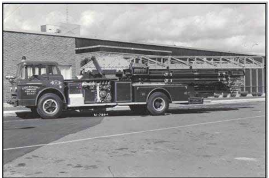
First Aerial Ladder – October 1961