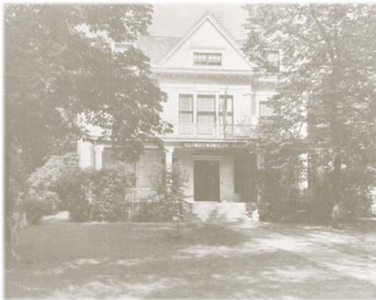
Broadwell Mansion – 1942 First Headquarters of the Association