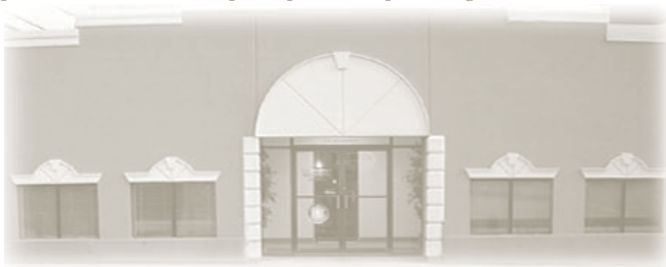
IAFFPD's current Headquarters at 230 Broadway in Springfield.

As we look into the future, we cannot help but look at our past. Our history has been rich and prosperous. The IAFFPD has a proud past and a promising future.